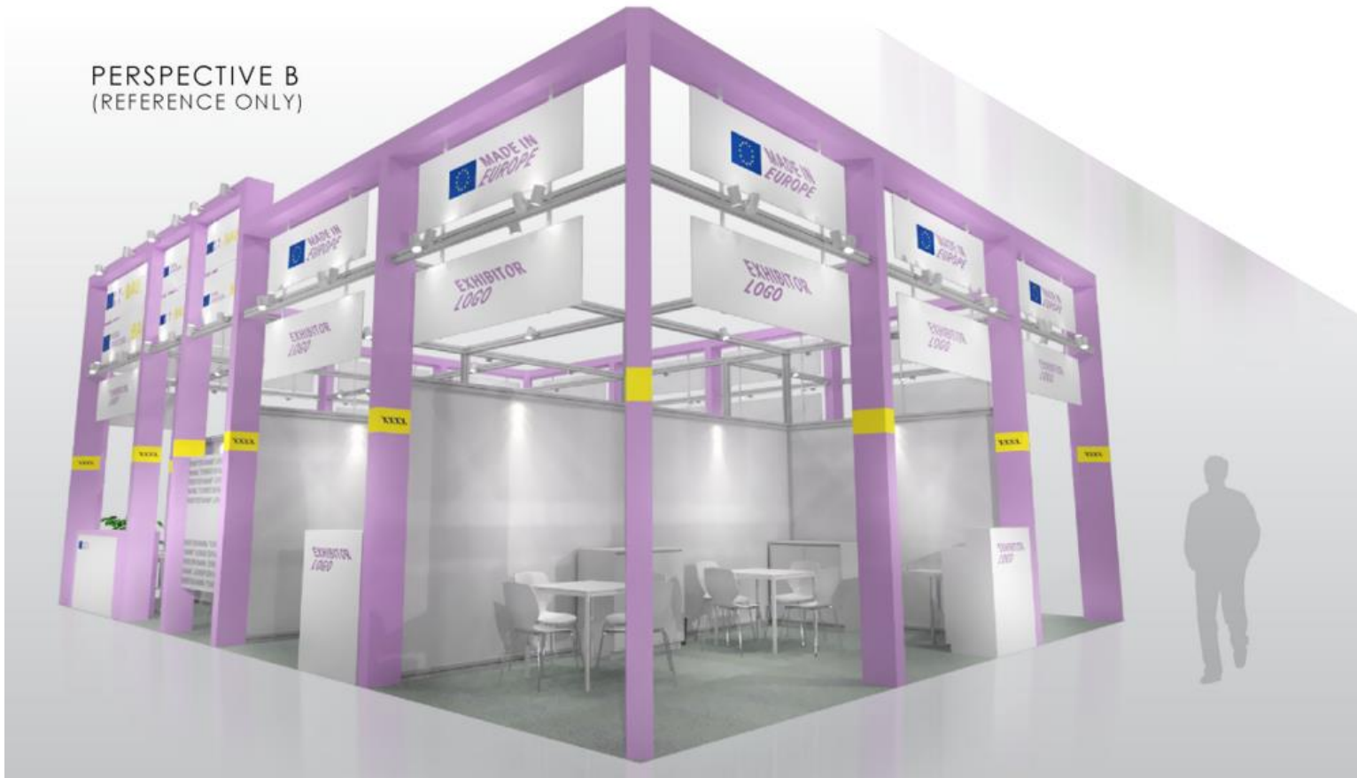
PERSPECTIVE B (REFERENCE ONLY)