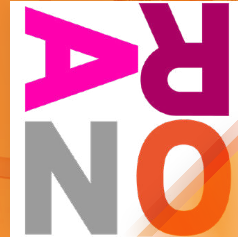
ARNO Design Stand Builder